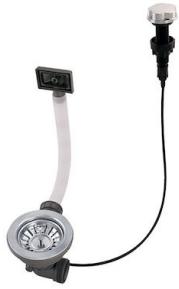
Automatic waste fitting