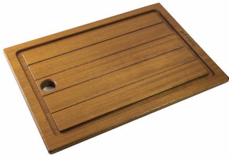
Iroko-wood chopping board 8643 117